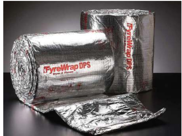
FyreWrap® DPS Insulation – Dryer Protection System

Encapsulating Material: The core insulation blanket is completely encapsulated in an aluminum foil, fiberglass reinforced scrim covering. This scrim provides additional handling strength as well as protection from moisture absorption and tearing.